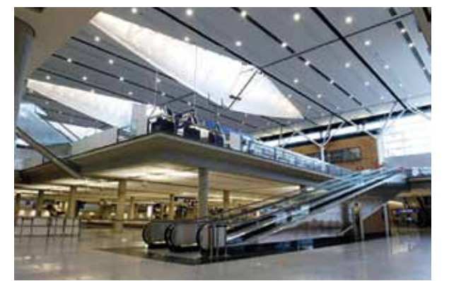
▶ Montréal-Trudeau Airport

The Port of Montréal, with service to and from more than 100 countries, offers the most direct link between Europe and North America's industrial heartland.