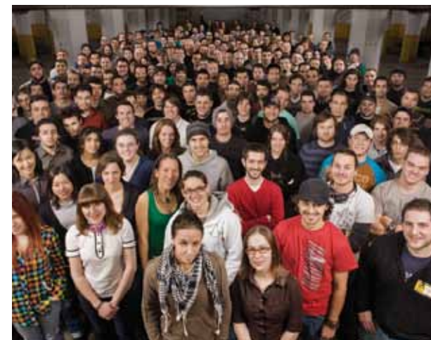
► Ubisoft, Montréal

DID YOU KNOW? In 2010, coming out of the global economic slowdown, total employment in Greater Montréal grew by 2.8%, allowing the Québec metropolis to rank 2 nd among the large North American cities.