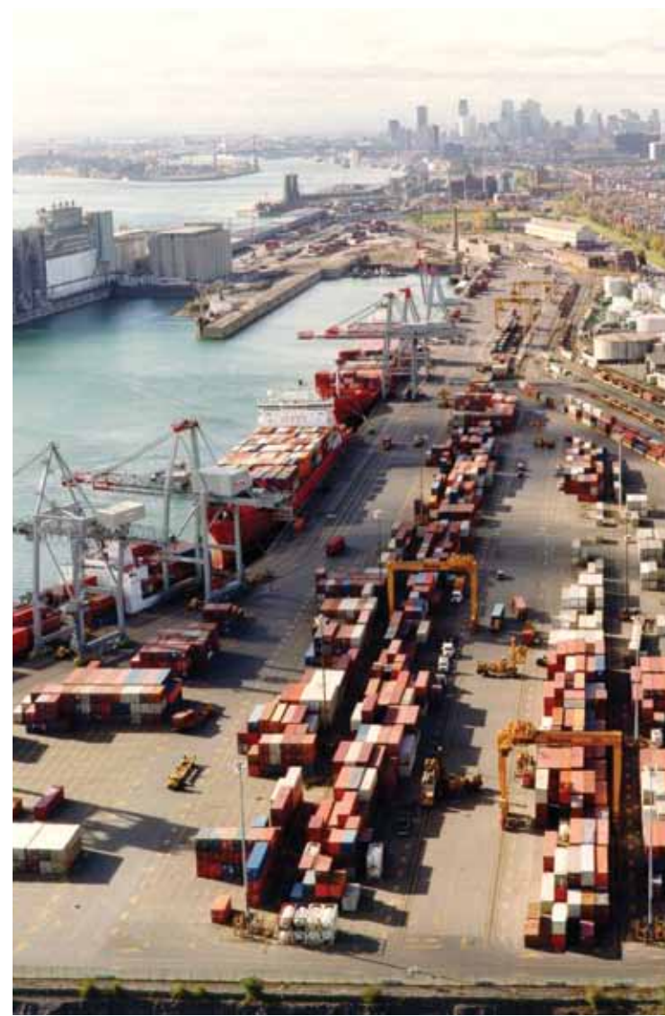
▶ Port of Montréal