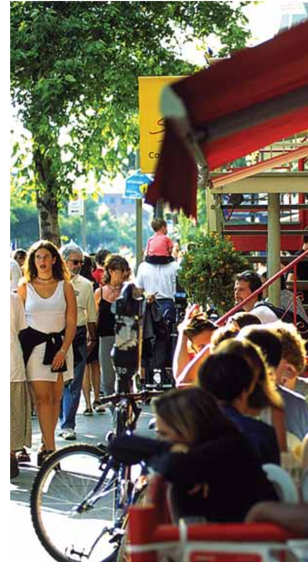
► Saint-Denis Street, Montréal