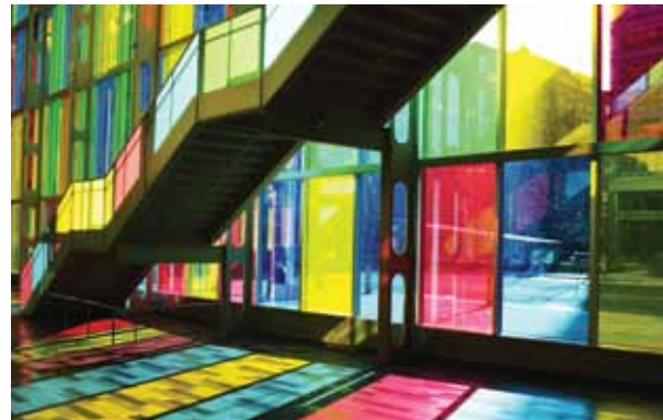
► Palais des congrès de Montréal

Montréal is a premier host city offering high-quality facilities and competitive costs for international meetings in North America. With the third-highest number of international meetings after New York and Washington, Greater Montréal offers a wide range of meeting facilities and accommodations. Located in the heart of the business district, the Palais des congrès de Montréal [convention centre], can accommodate major events of up to 30,000 people. It offers specialized and personalized support to organizations that are looking to hold international conventions or events in Montréal.