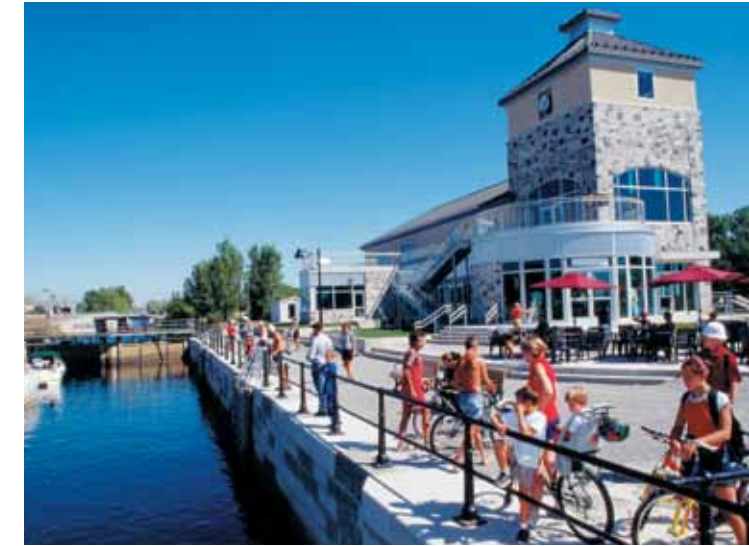
► Lachine Canal, Montréal