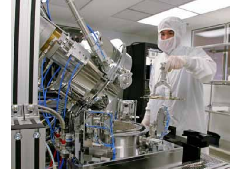
► National Research Council Canada (NCR)

These projects offer Montréal an opportunity to excel, innovate and stand out as a creative metropolis. Appointed UNESCO City of Design, Montréal intends to benefit from these projects and become a great laboratory for innovation.