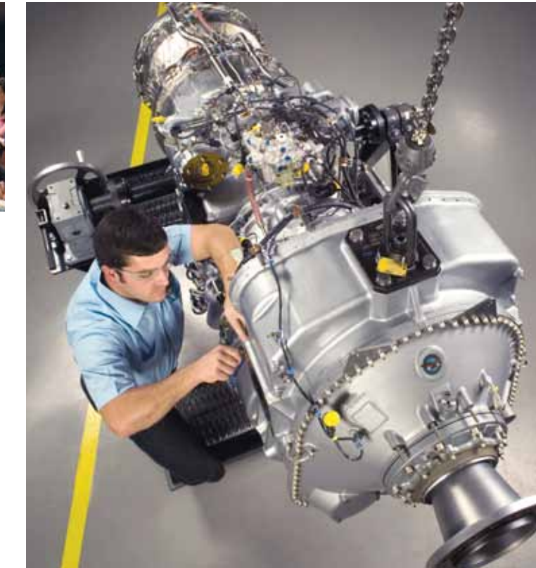
► Pratt & Whitney, Longueuil

A leader in the new economy, Greater Montréal is one of North America's main innovation centres thanks to its diversified and distinctive industrial structure centred on high-technology clusters such as aerospace, life sciences and health technologies (LSHT), information and communications technologies (ICT) and clean technologies.