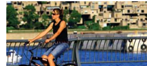
► Habitat 67, Montréal

A green city, Montréal features a harmonious tapestry of urban and green spaces from Mount Royal to the shores of the St. Lawrence River. Transportation options abound, thanks to the region's extensive network of pedestrian walkways, roads, public transit and Bixi—the city's public bike system.