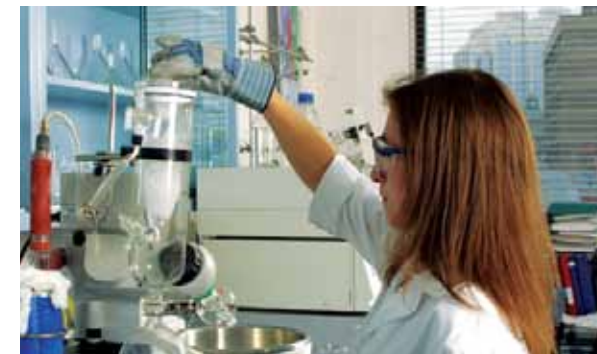
► Research Centre, Montréal

Greater Montréal ranks 1 st in Canada for the number of non-profit research centres and university researchers and has the highest investments in university research . The proportion of high-technology jobs in the region is comparable to that of major U.S. centres such as Dallas, San Diego and San Francisco, close to one in ten jobs.