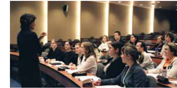
► Université de Montréal