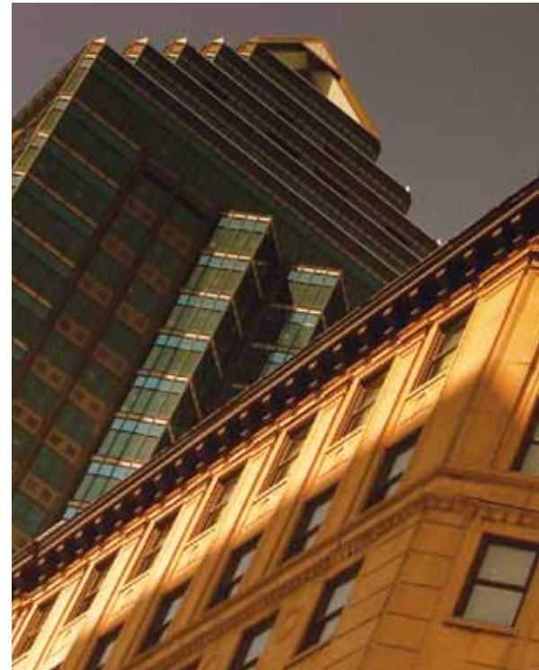
► Downtown Montréal

The Montréal metropolitan area offers industrial and office space at extremely competitive costs . It offers the best total office space occupancy costs among the largest Canadian and U.S. agglomerations.