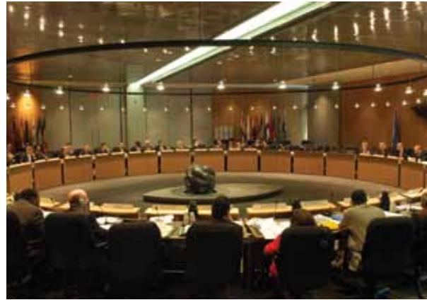
► International Civil Aviation Organization (ICAO), Montréal