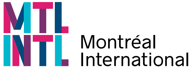
Primary horizontal colour version to be used