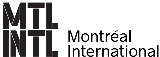
Monochrome variants, to be used as a last resort

Nevertheless, please get approval from Yohann Rabusseau before using our logotype to ensure compliance with usage standards.